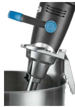
WSBBC Big Stix® EvolutionX® Immersion Blender Bowl Clamp