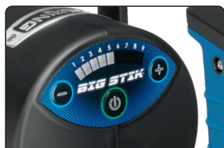
Electronic speed adjustment with LED indicator